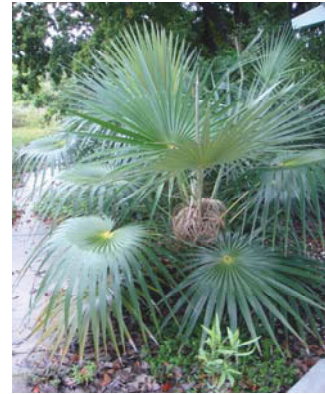
Old Man Palm

This slow growing native of Cuba reaches 25 feet. It is named for the thick, wooly, fibrous material covering its trunk like the beard of an old man. The mature plant has stiff, palmate leaves. Unisex flowers appear in warm months followed by purple fruit. It is highly salt tolerant and moderately drought tolerant. Located on Chapel Path.